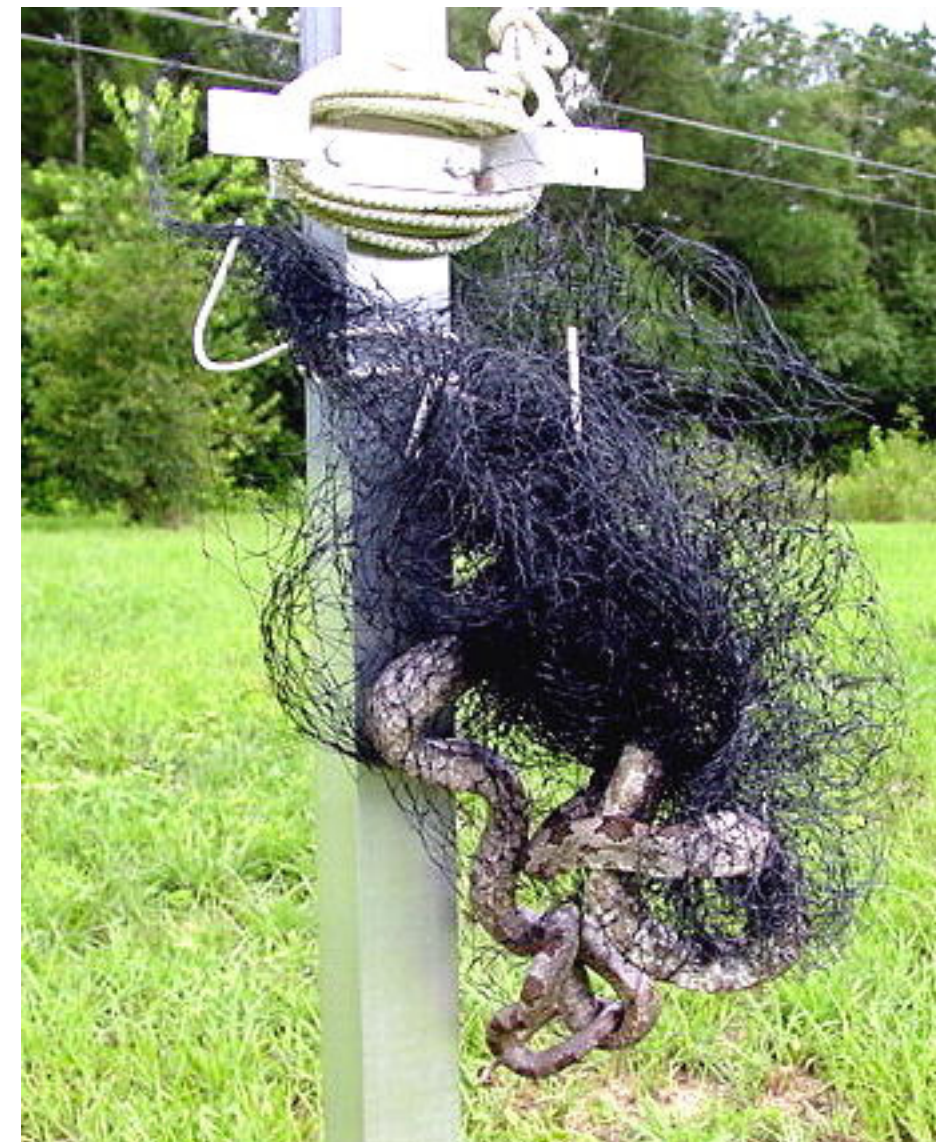
Rat Snake caught in netting and safely relocated to a new home.

Meshing can be located at home supply garden centers such as Lowes, and Home Depot. Ask for "Bird Netting"