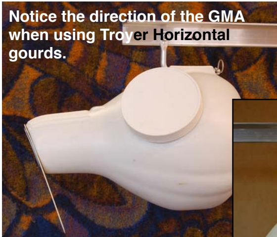
Notice the direction of the GMA when using Troyer Horizontal gourds.