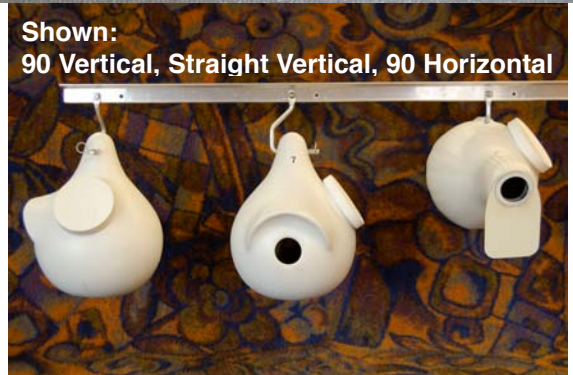
Shown: 90 Vertical, Straight Vertical, 90 Horizontal

Vertical Mounting Arms are ideal for Super Gourds, and natural gourds, and horizontal mounting arms are ideal for Troyer Horizontal Gourd and S & K gourds.