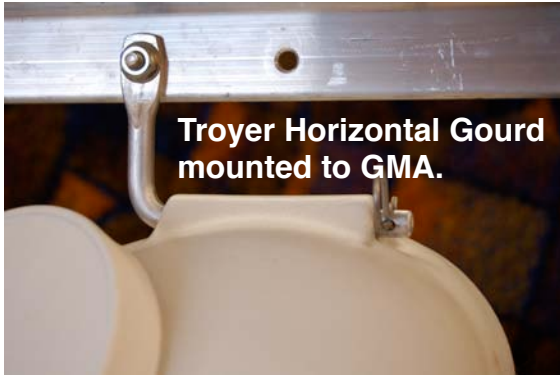
Troyer Horizontal Gourd mounted to GMA.