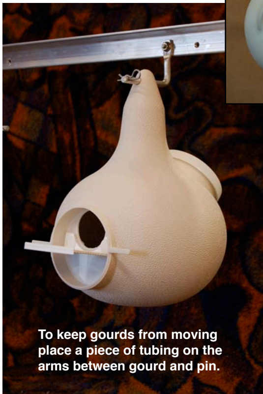
To keep gourds from moving place a piece of tubing on the arms between gourd and pin.