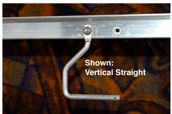
Shown: Vertical Straight