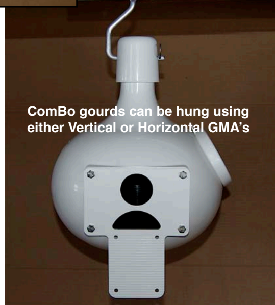
ComBo gourds can be hung using either Vertical or Horizontal GMA's