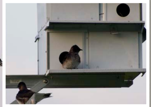
LEFT, THE GEMINI AND THE HYBRID WITH SAFE HAVENS IN USE 2010 SEASON, ABOVE SY LEAVING NESTING COMPARTMENT