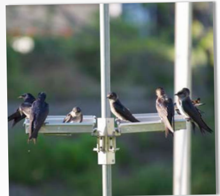
WAITING ON ME!