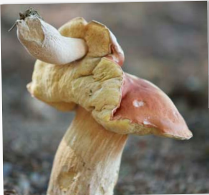
MUSHROOMS STUCK TOGETHER

Our new 2011 catalog should mail at the end of the year just in time for the returning martins. More about new products in the next issue of the Dawnsong.