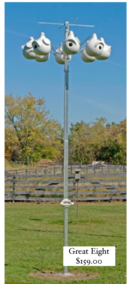
Great Eight $159.00