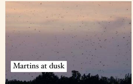
Martins at dusk