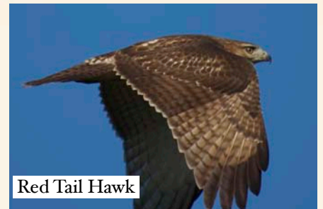
Red Tail Hawk